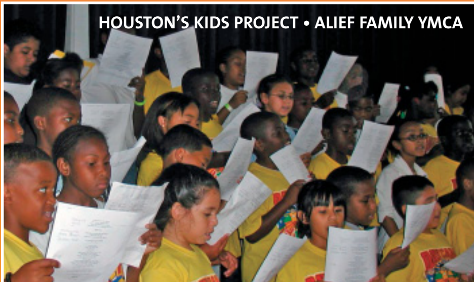
HOUSTON'S KIDS PROJECT • ALIEF FAMILY YMCA

"This experience has changed me. I want to work for the YMCA again next year."