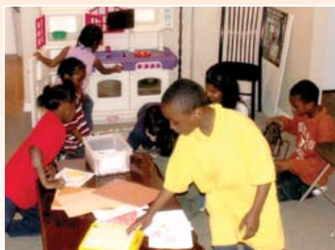
Monday through Friday, from 4:00 to 6:00 p.m., the YMCA apartment outreach program at Bayou Landing provides after school fun for youth.