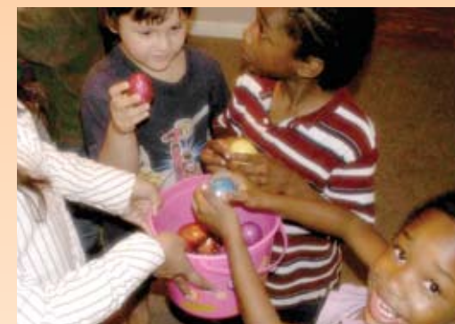
During Holy Week, the children enjoyed Easter games and treats.