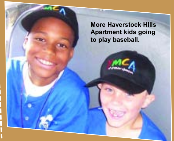
More Haverstock Hills Apartment kids going to play baseball.