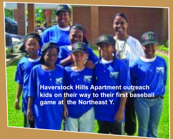
Haverstock Hills Apartment outreach kids on their way to their first baseball game at the Northeast Y.