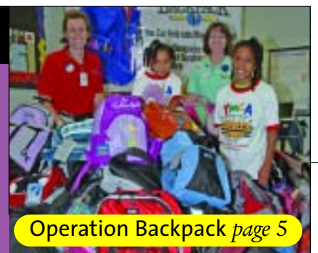
Operation Backpack page 5