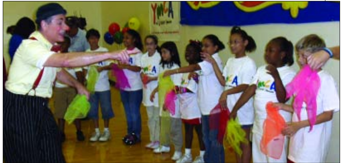
Ringling Brothers entertained the School at Post Oak kids while teaching them the importance of fitness in everyday life.

We are thrilled to join Ringling Brothers and Barnum and Bailey in this venture as we work to build a healthy spirit, mind and body for all of our children. Together we're working to make YMCAs even better at strengthening the health of children and teens.