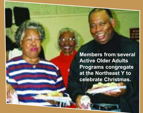
Members from several Active Older Adults Programs congregate at the Northeast Y to celebrate Christmas.