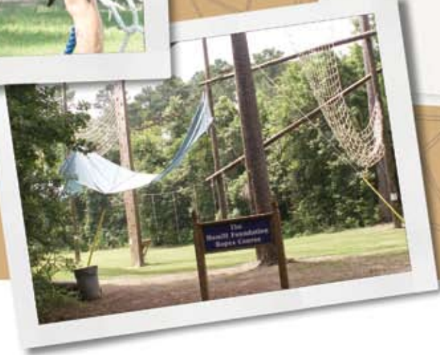
The Hammill Foundation helped the YMCA provide a new ropes course for campers this summer. The course is now one of the most popular activities at Camp Cullen and helps youth build self-confidence.