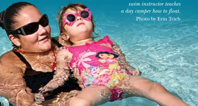
Below: An E.A. Smith Family YMCA swim instructor teaches a day camper how to float.